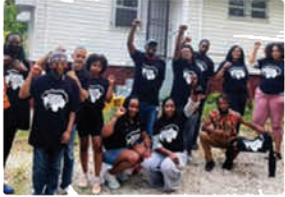
Community Movement Builders Law for the People Award