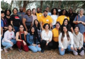
Florida Immigrant Coalition Daniel Levy Award