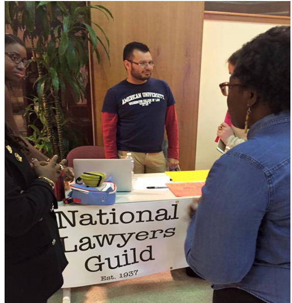
NLG students tabling at American University in Washington DC