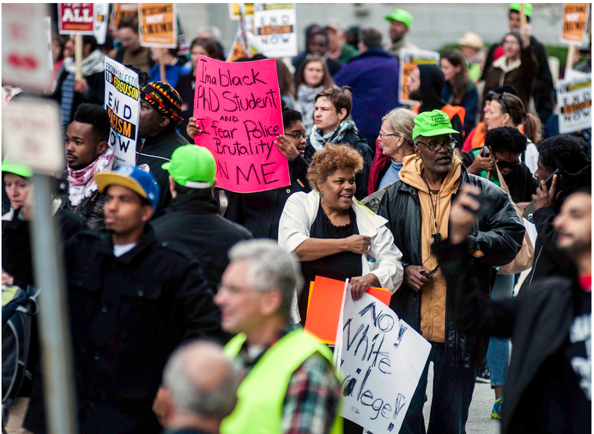
NLG Legal Observers attend an action in Ferguson, MO in 2014