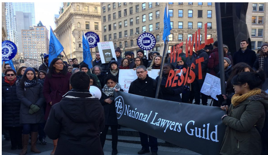
Law Strikes Back rally organized by the NLG at Foley Square in NYC in response to the election of Donald Trump

notably in Ferguson, Baltimore, Charlotte, NYC, Louisville, and Minneapolis. NLG members traveled to Standing Rock and helped form the Water Protector Legal Collective, which provides ongoing assistance to those arrested for their resistance to oil pipelines. Through formal resolutions, the NLG membership voted to support the abolition of prisons and police. In 2018, the NLG endorsed the nationwide prison strike and contributed to legal support in the aftermath. When the Trump administration began targeting immigrants and other marginalized communities, NLG members organized courthouse demonstrations across the country in a day of "Law Strikes Back" actions. The NLG supported anti-fascist counter-demonstrators who challenged the increasing number of white supremacist groups and rallies. In 2020, the NLG Mass Defense Program played a central role after the police murder of George Floyd, providing legal assistance to 20,000 arrestees during the uprising. NLG staff and members set up legal and jail support hotlines across the country, provided training and education to thousands of organizers and attorneys, and assisted activists targeted by federal prosecution and grand jury investigations. The NLG continues to support abolitionist movements, most recently by challenging the repression of activists working with the #StopCopCity movement