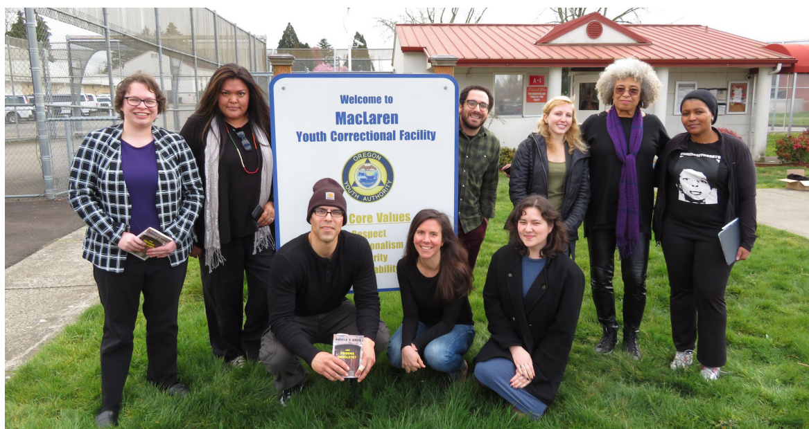
Dr. Angela Davis joined the Lewis and Clark NLG's abolition group at MacLaren Youth Correctional Facility to talk about prison abolition, collective organizing, and critical resistance. The group meets every other week with youth who are incarcerated to have discussions, bring in guest speakers, and work on projects.