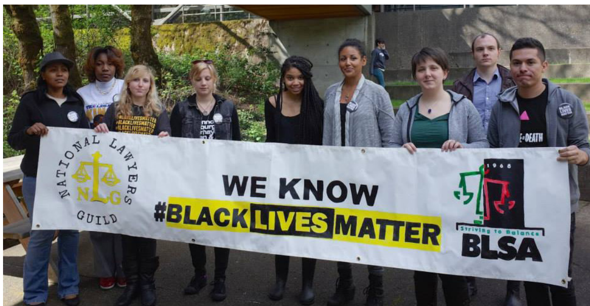
■ Lewis and Clark NLG and BLSA on the 2016 NLG Day of Action to Support the Movement for Black Lives.