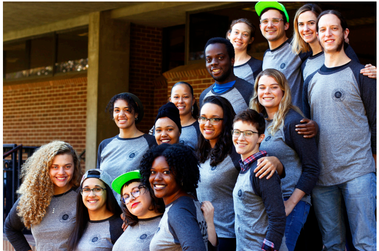
University of North Carolina NLG students in 2019

The national student email list, as well as the strong personal connections made at regional and national meetings allow the chapters to coordinate as a national network. NLG students also coordinate for national actions: every year in March, student chapters from across the country hold simultaneous events that call for the abolition of the prison-industrial complex in our national student Week of Abolition. Student chapters hold press conferences, have speakers and speak-outs, and educate their fellow classmates by tabling or fliering the school. Other student-led projects include the NLG Radical Law Student Project and days of action against rising student debt. In addition to attention-grabbing national actions, chapters support each other across state lines by sharing resources, strategies, and action plans that worked for their chapter.