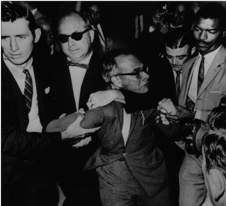
Arthur Kinoy being dragged from the hearing room of the House UnAmerican Activities Committee (HUAC) in 1966.

Throughout the 1960s and 1970, the NLG members continued to provide legal support to emerging social movements. NLG members represented Vietnam War draft resisters, antiwar activists, the Chicago 7 after the 1968 Chicago Democratic Convention, and GIs who opposed the war. NLG members also defended FBI-targeted members of the Black Panther Party, the American Indian Movement, and the Puerto Rican independence movement.