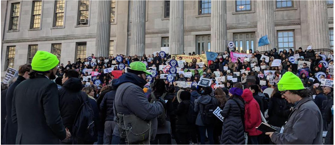
NLG legal observers at Brooklyn rally to demand ICE out of courts, December 2017.

T he National Lawyers Guild has a long and rich history of supporting movements for social justice. While we are very proud of this history, we are also excited about the new members who will shape the future of the NLG! We need your passion and creativity if we are to continue to adapt in this ever-changing political climate.