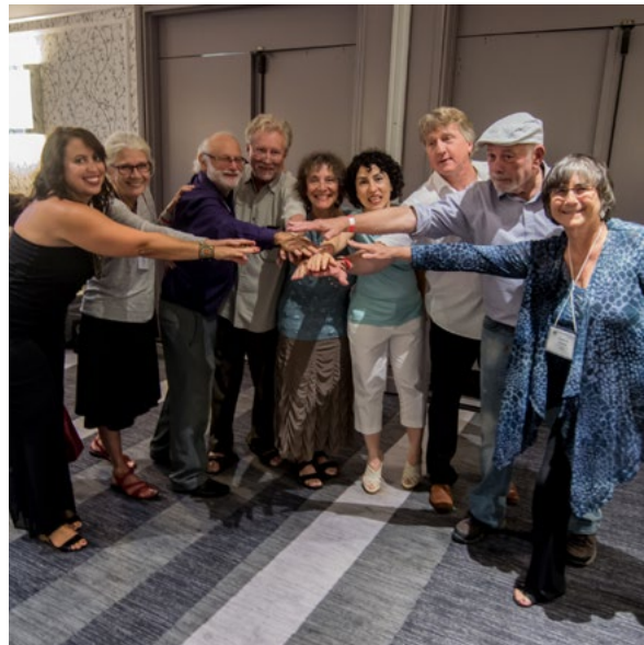
Above: Past (and one current!) NLG Presidents at the 2017 Awards Dinner.

nlg.org/dinnerjournal and nlg.org/sponsorships