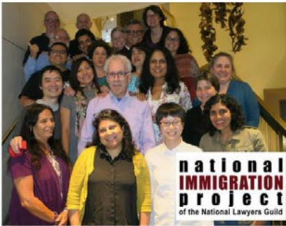
LAW FOR THE PEOPLE AWARD