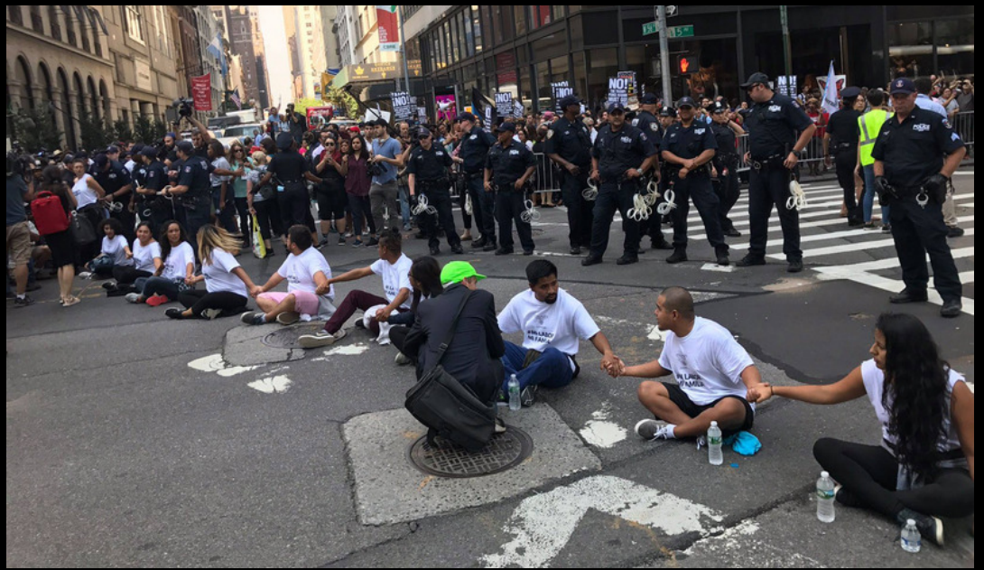
Clockwise from top: Legal observer documents arrest of activists at Trump Tower in NYC following the announcement of the DACA repeal, Sept. 2017 ; Legal Observers in Ferguson, MO ; NLG Legal Observers at the "Unite the Right" rally, in Charlottesville, VA August 2017.