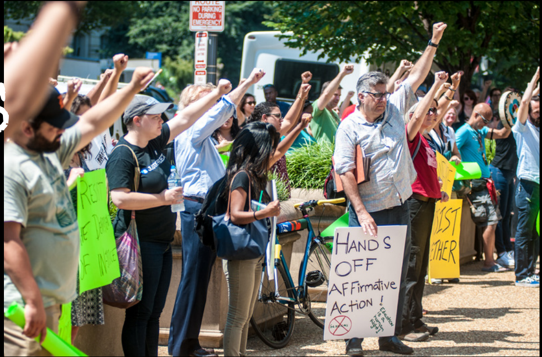
NLG members outside the Department of Justice during the 80th annual #Law4thePeople Convention in Washington, DC, August, 2017.