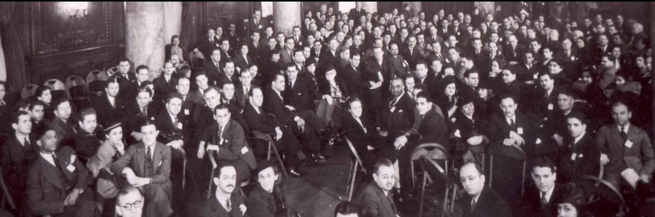
NLG founding convention, 1937.

-Preamble to the NLG Constitution (1937)